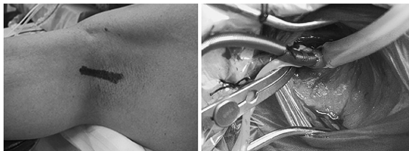
Figure 1. RAxA perfusion in the axilla. The distal part of the RAxA was exposed through a 5- to 7-cm skin incision in the axilla. A 10F to 16F straight thin-walled cannula was inserted depending on the size of the artery.